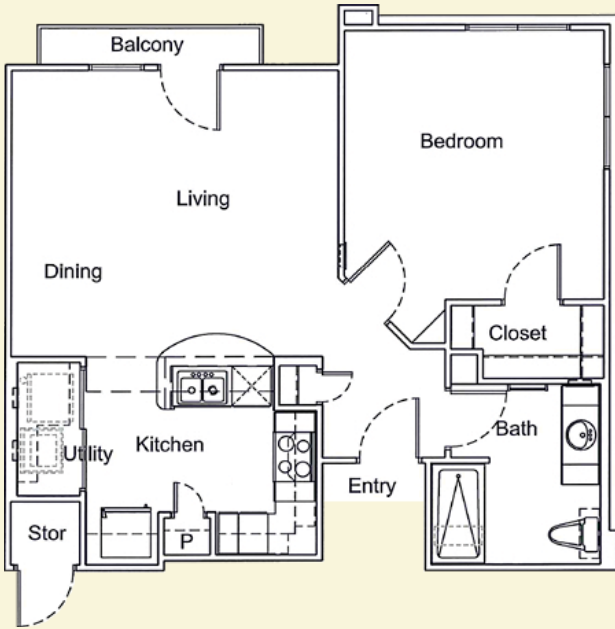
A1 1 Bdrm / 1 Bath 750 Sq. Ft.*